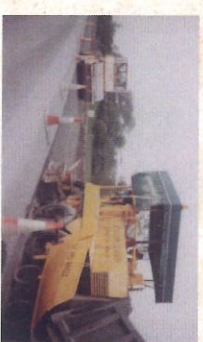
Early days roadworks

In the late 90's and with the increase in funding for roads the company decided to install a tarmac production plant facility. Although a significant and costly investment fortunately it coincided with an increase in grants for road making.