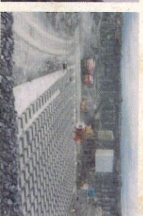
Block making in the 80's

Diversity, continuous development and improvement have been the hallmark of McGrath's success over the years. Following tests carried out on the quality of the limestone in the Quarry it was found to have a high calcium content containing little or no impurities. Our lime therefore, proved highly suitable for the production of animal feeds (calcium) and for the production of glass and many other ancillary uses.