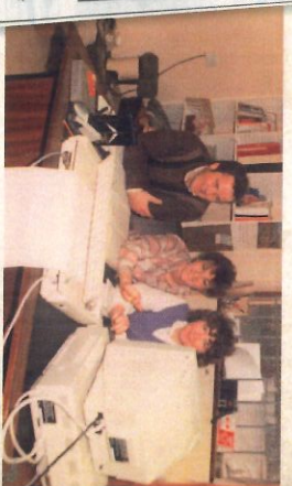
Our first computer

In 1983 the next major milestone involved the setting up of a Ready mix Concrete Plant and thankfully demand for ready mix concrete was high especially with farm improvements and related building projects. A Concrete Block Making facility followed shortly after opening a complete package for the then burgeoning house-building industry.