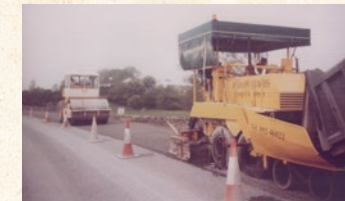
Early days roadwork's

In the late 90’s and with the increase in funding for roads the company decided to install a tarmac production plant facility. Although a significant and costly investment fortunately it coincided with an increase in grants for road making.