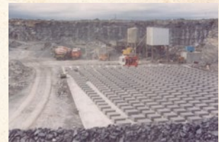
Block making in the 80's

Diversity, continuous development and improvement have been the hallmark of McGrath’s success over the years. Following tests carried out on the quality of the limestone in the Quarry it was found to have a high calcium content containing little or no impurities. Our lime therefore, proved highly suitable for the production of animal feeds (calcium) and for the production of glass and many other ancillary uses.