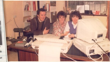
Our first computer

In 1983 the next major milestone involved the setting up of a Ready mix Concrete Plant and thankfully demand for ready mix concrete was high especially with farm improvements and related building projects. A Concrete Block Making facility followed shortly after opening a complete package for the then burgeoning house-building industry.